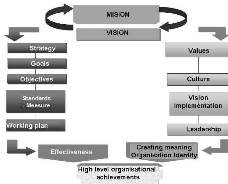
Figure No. 1: Full Range Leadership theory (Katz, 2007)

The following diagram illustrates the model: